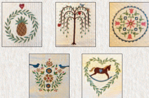
Details of this year's quilt.